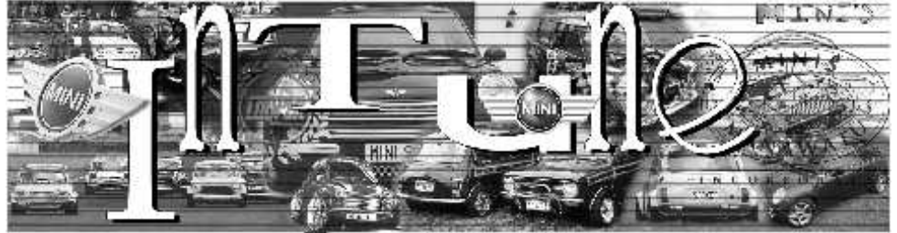
Club Newsletter of Minis Manawatu Incorporated