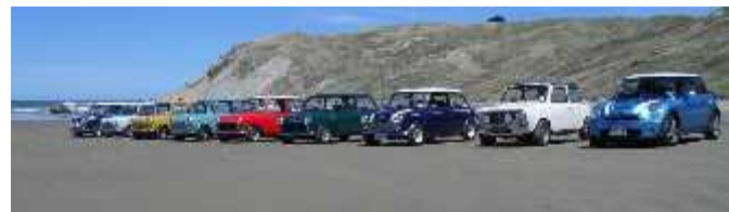
The nine Minis on the beach, less one that stayed at the carpark, plus one we picked up at the beach, and less the two non-Minis that drove to the Pub for an "extended" lunch break.

On arrival in Waipukurau it was 29°C, so Brendon decided we should all "regroup" at Hatuma Café for a drink and ice-cream. Cars also needed a drink after covering just on 100miles on the economy run.