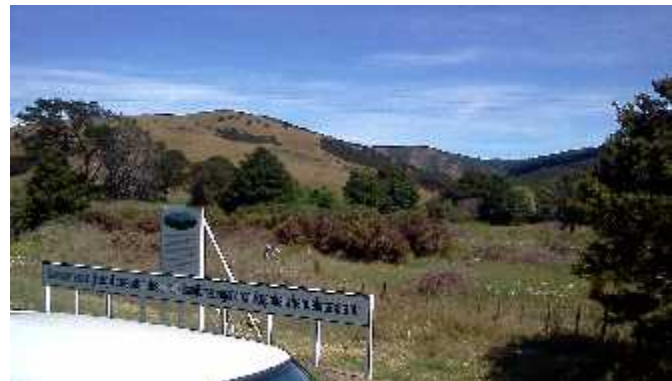
Taumatawhakatangihanga-koauauotamateaturipukaka-pikimaungahoronukupokaiwhenuakitanatahu (as it is often abbreviated) is the second hill from the left.