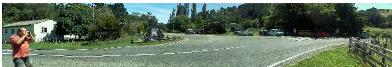
Wimbledon School and War Memorial gave us another perfect photo opportunity.

Lunch was had sitting amongst the tussock grass, where we were sheltered from the wind. One