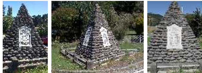
Next stop, the Wimbledon War Memorial.

brave soul went for a swim while others put their toes in the cold water. By now it was time to line the cars up for a photo (see below), before heading for Waipukurau in a roundabout way.