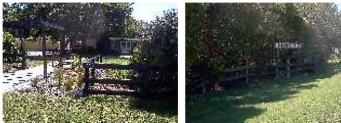
Our first stop, Weber School.

We all filled our petrol tanks to the brim and set off for Porangahau Beach via places like Weber,