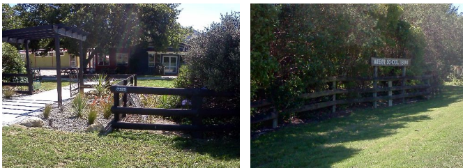
Our first stop, Weber School.

We all filled our petrol tanks to the brim and set off for Porangahau Beach via places like Weber,