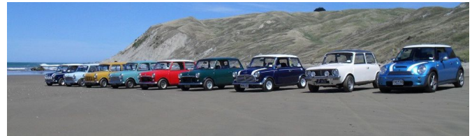
The nine Minis on the beach, less one that stayed at the carpark, plus one we picked up at the beach, and less the two non-Minis that drove to the Pub for an "extended" lunch break.

On arrival in Waipukurau it was 29°C, so Brendon decided we should all "regroup" at Hatuma Café for a drink and ice-cream. Cars also needed a drink after covering just on 100miles on the economy run.