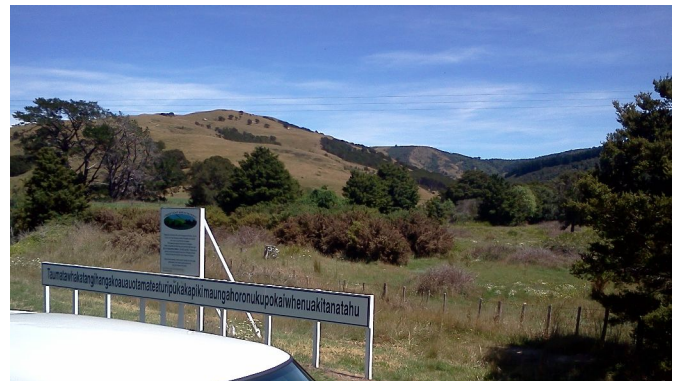
Taumatawhakatangihanga-koauau-o-Tamatea-turipukaka-piki-maunga-horonukupokai-whenuakitanatahu (as it is often abbreviated) is the second hill from the left.