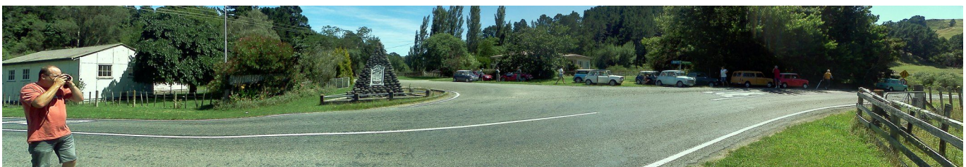
Wimbledon School and War Memorial gave us another perfect photo opportunity.

Lunch was had sitting amongst the tussock grass, where we were sheltered from the wind. One