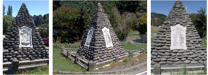
Next stop, the Wimbledon War Memorial.

brave soul went for a swim while others put their toes in the cold water. By now it was time to line the cars up for a photo (see below), before heading for Waipukurau in a roundabout way.